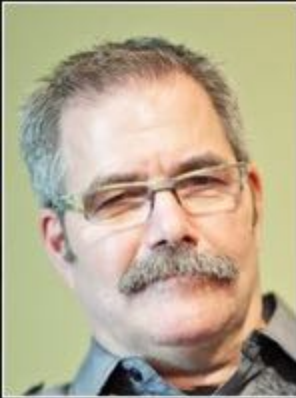
Paul David Tripp