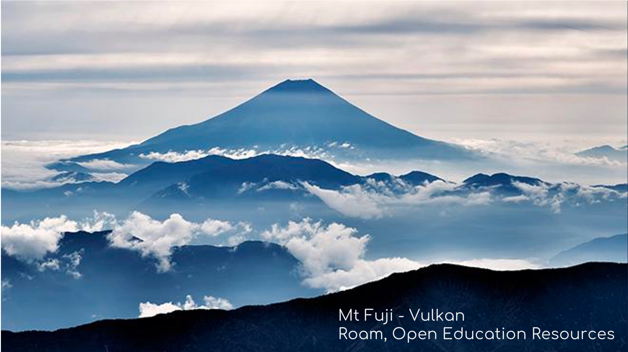
Mt Fuji - Vulkan Room, Open Education Resources