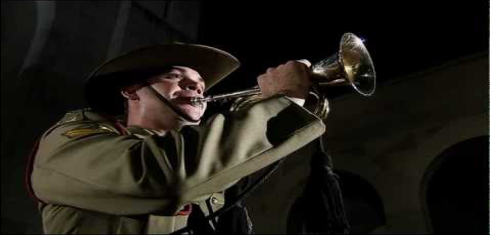
The Last Post - Royal Australian Air Force