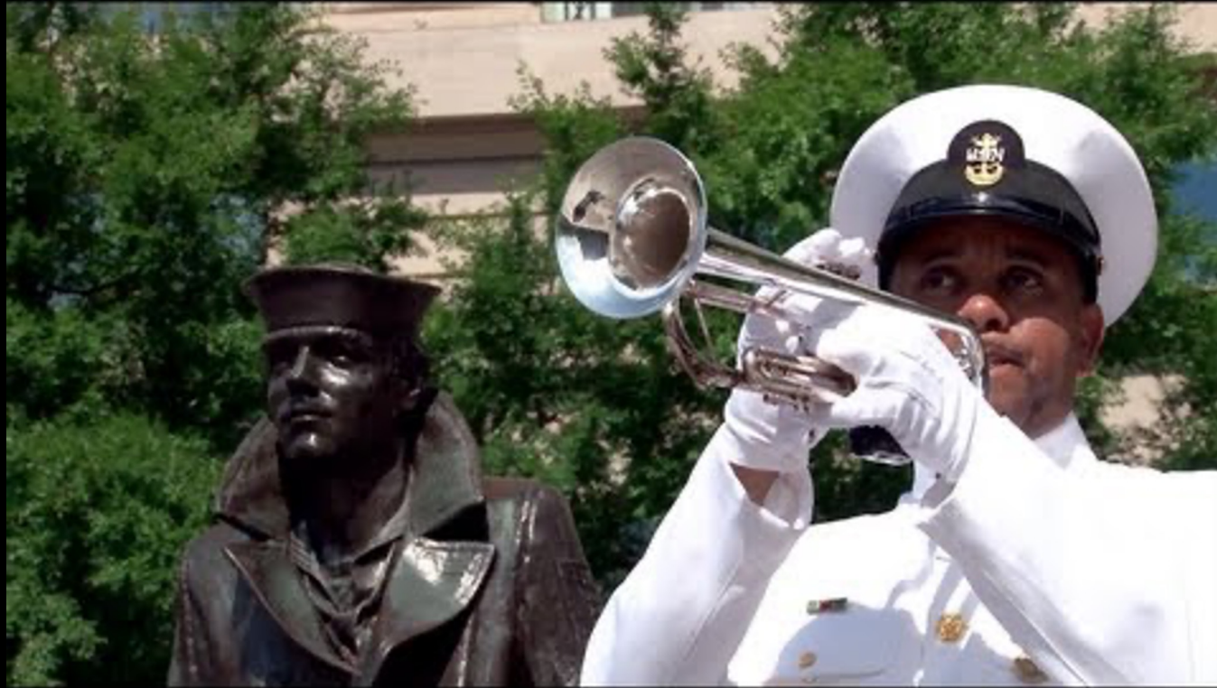
TAPS - United States Navy