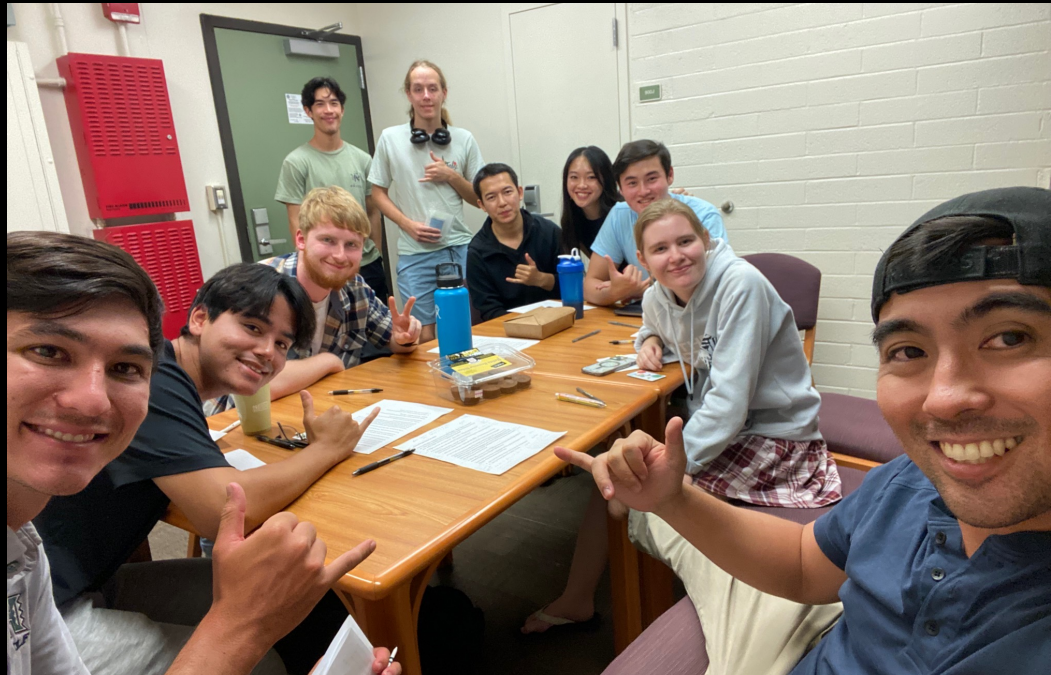
Left: Post spring break- service project snack run Right: Dorm Bible study.