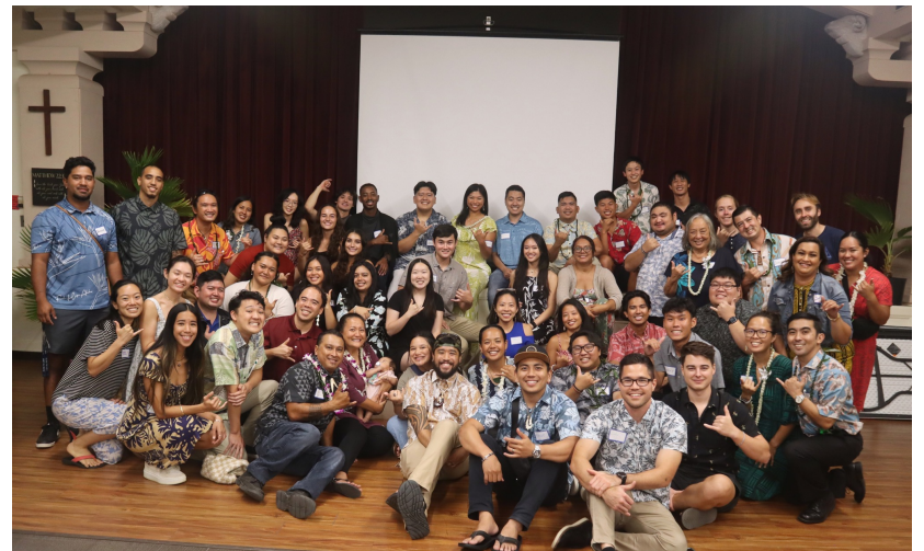
InterVarsity Hawai'i 75 year anniversary

InterVarsity Christian Fellowship Associate Area Director in Hawai'i Team Leader of HI-Light at UH Mānoa